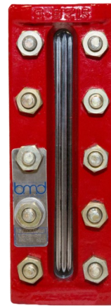
LG20-R (Reflex Style)

NACE Compatible: Wetted parts conform to NACE MR-01-75 specifications for sour gas service.