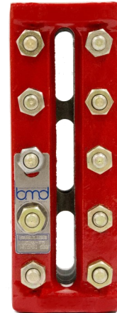
LG20-T (Transparent Style)